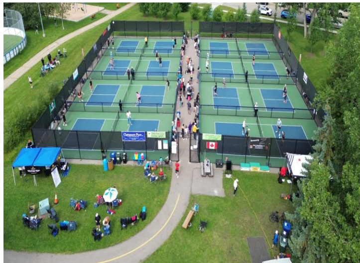
Sherwood Heights Courts Strathcona County Pickleball 2025 Sanctioned Tournament

We invite you to explore our various sponsorship tiers and join us in supporting an active, healthy lifestyle in Strathcona County.