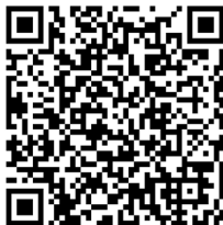
Player Match Queue