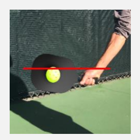
Figure 4-2 (illegal serve)