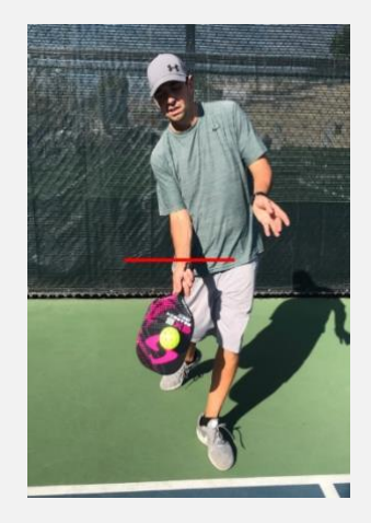
Figure 4-1 (legal serve)