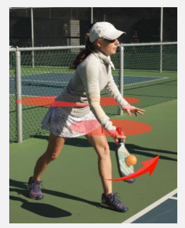
Figure 4-3 (legal serve)

(Photos and graphics courtesy of Steve Taylor, Digital Spatula)