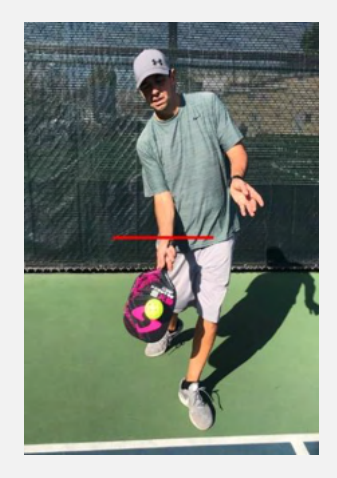
Figure 4-1 (legal serve)