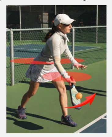
Figure 4-3 (legal serve)