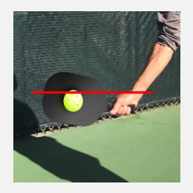
Figure 4-2 (illegal serve)