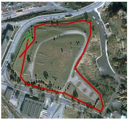
1 km Loop