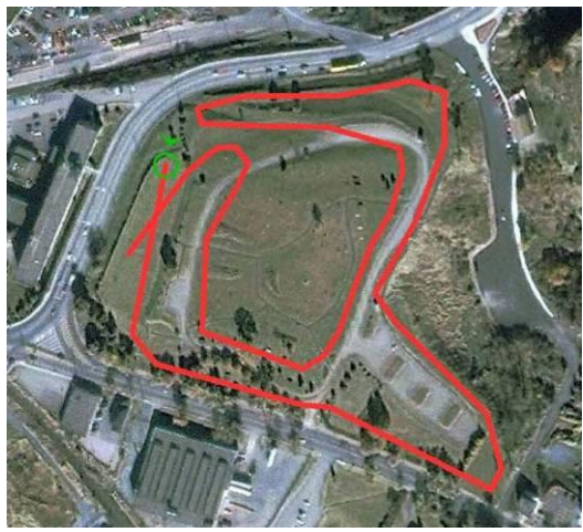
1.6 km Loop