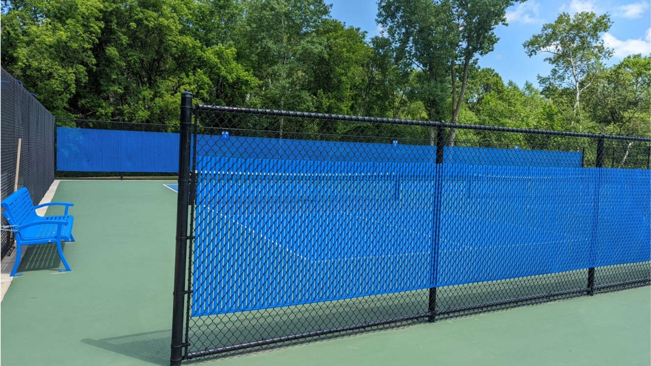
Photo 7, Windscreen Fence Insert Details