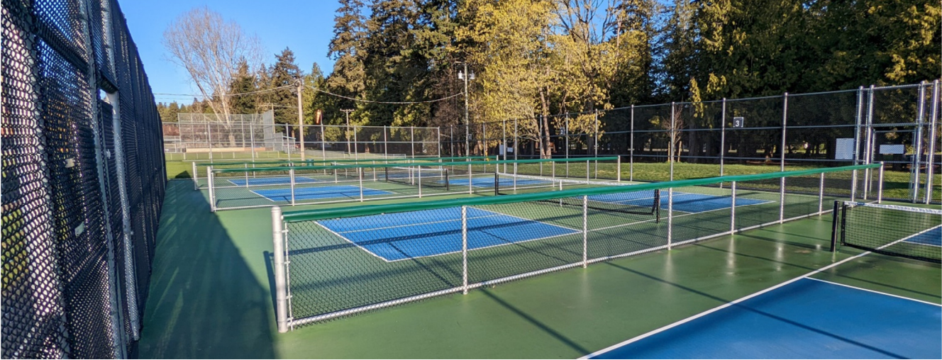
Photo 2, Entrance and Egress Gates with Intermediate Fencing in Delta BC