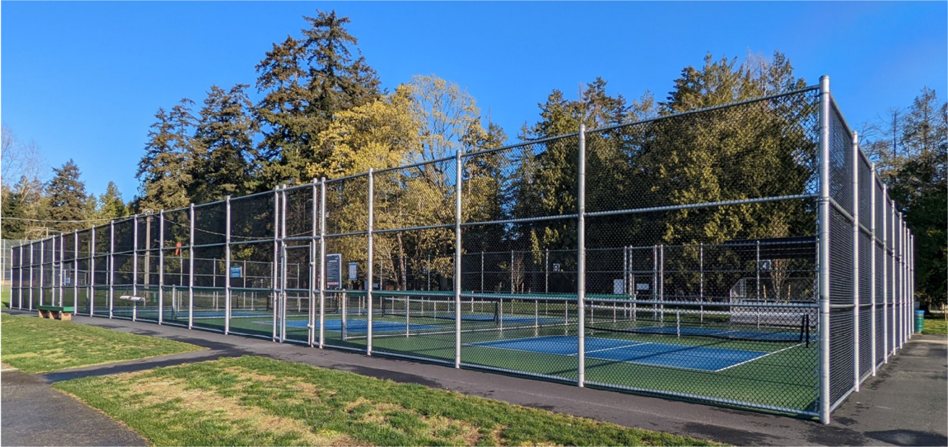
Photo 4, Swept Debris Removal Gate