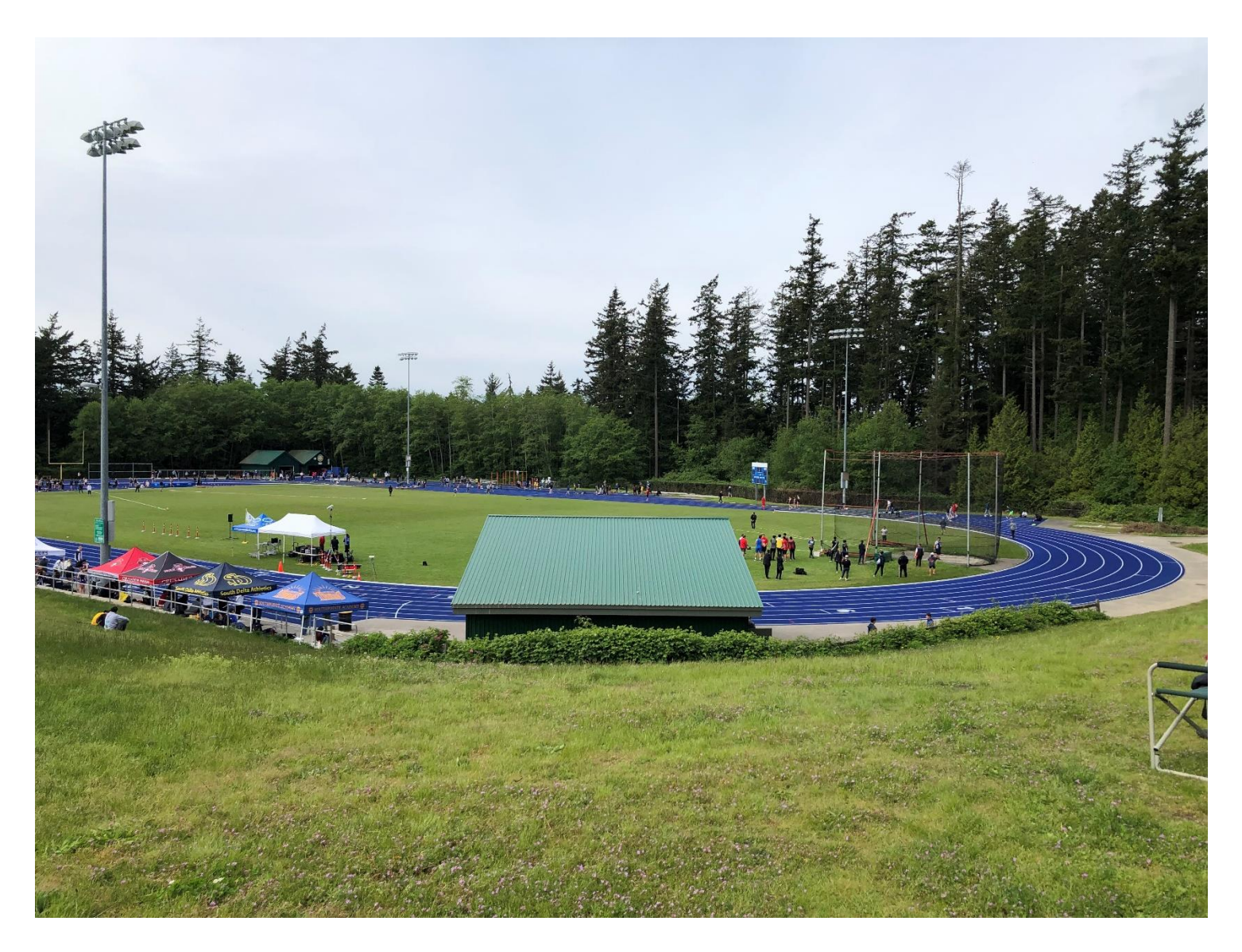
Hosted by Ocean Athletics Track and Field Club – oceanathletics.club

Address: South Surrey Athletic Park is located at 146th St. on 20th Ave. in South Surrey. Parking is located in the lot above the park, across the street at the South Surrey Recreation Centre or the large parking lot off 148<sup>th</sup> Street at 18<sup>th</sup> Avenue (Semiahmoo Secondary School).