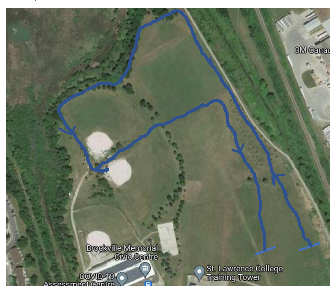
Course Maps 1km – U8/U10