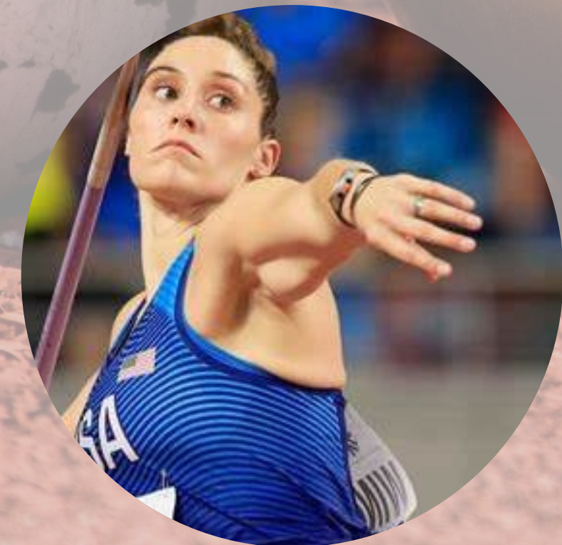
KARA WINGER (USA)