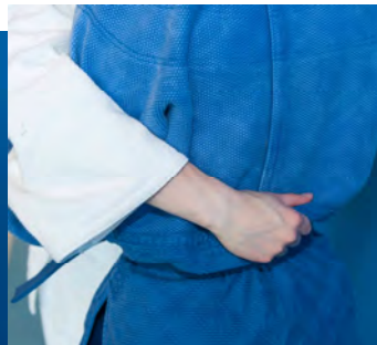
Right: belt or close to the belt